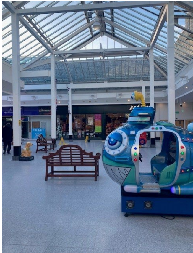
Internal views of the Oak Mall at the atrium where demolition is proposed to extend to