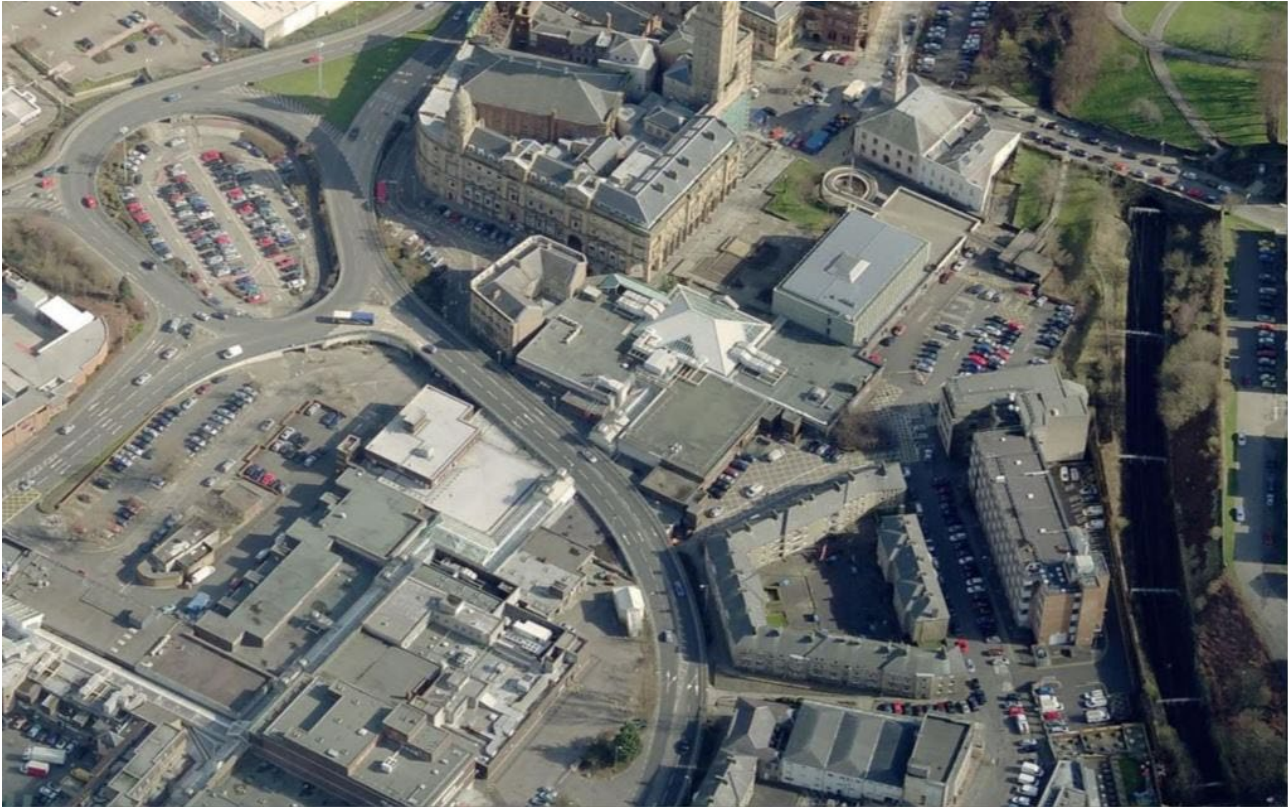
Aerial view of the application site

By acceptance of the demolition works and the wider redevelopment proposals a flexible and proactive approach is taken in addressing the new opportunities to diversify town centres, to accelerate urban greening and make sustainable use of assets to benefit communities. It can be concluded that the works would generally improve the visual and functional quality of the town centre.